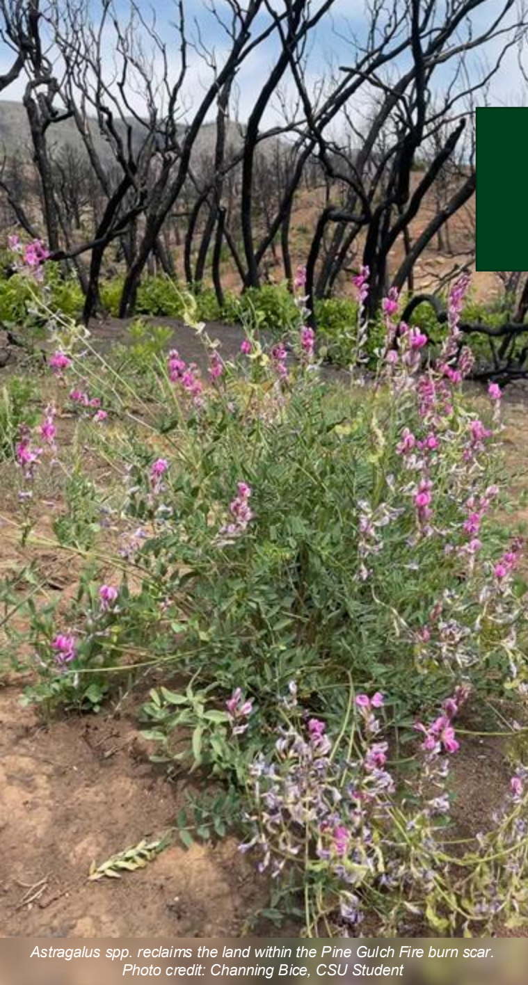
Astragalus spp. reclaims the land within the Pine Gulch Fire burn scar.