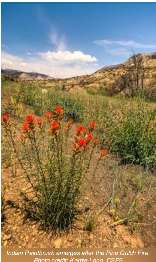
Indian Paintbrush emerges after the Pine Gulch Fire.