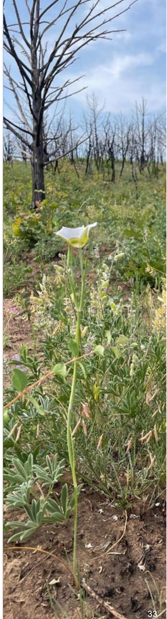
Sego lily emerges in the Pine Gulch Fire burn scar.