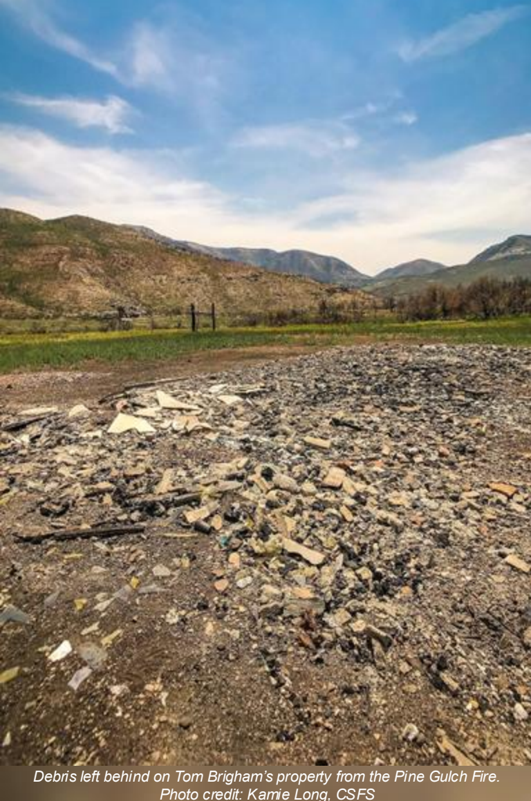
Debris left behind on Tom Brigham's property from the Pine Gulch Fire.