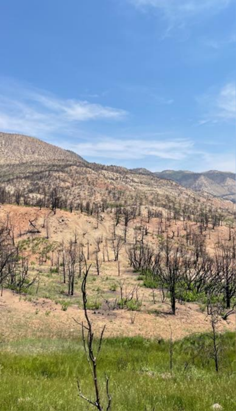
Pine Gulch Fire burn scar, Garfield County, CO.