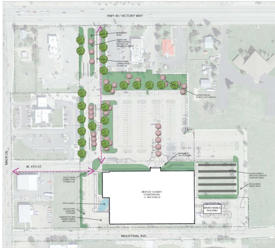
MOFFAT COUNTY COURTHOUSE - SITE MASTER PLAN